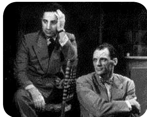
Elia Kazan & Arthur Miller on the set of THE CRUCIBLE